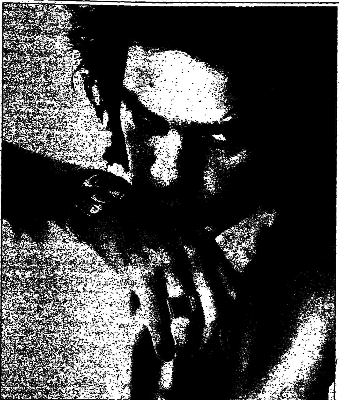
Nick Cave's lyrics are as gruesome as ever, but his melodies are definitely getting stronger.

There is something original about exploring humanity's underbelly with rich harmonies and a jolly swing. But a whole album?